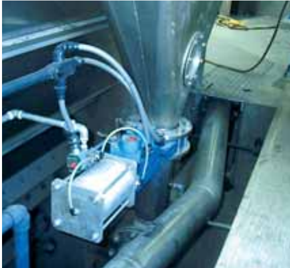
Knife gate at a screenings hopper and second vacuum conveyor line