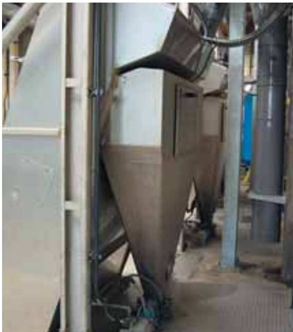
Screenings hopper at a STEP SCREEN® SSV