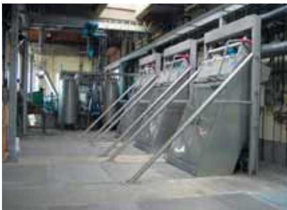
Vacuum Conveyor system in North Davis, UT: Vacuum Buffer Tanks (background) serving several STEP SCREENS® SSV (foreground)