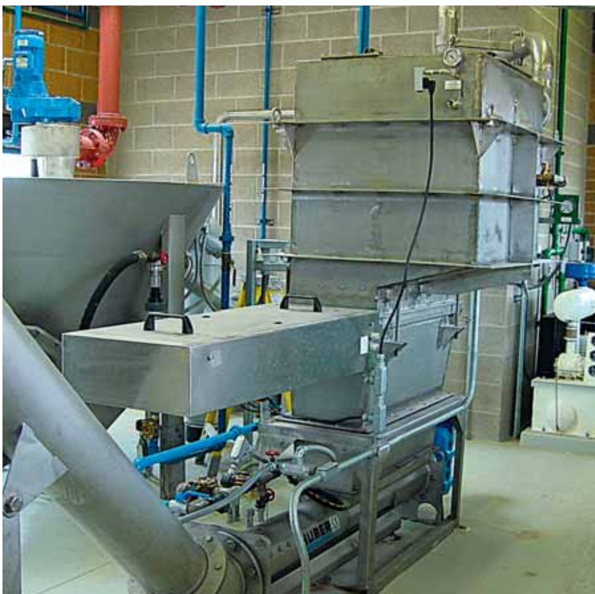
Vacuum Conveyor System in Magna, UT: Reception Unit (center) above a WAP, Vacuum Pumps (background right), and Grit Washer RoSF4 (left)